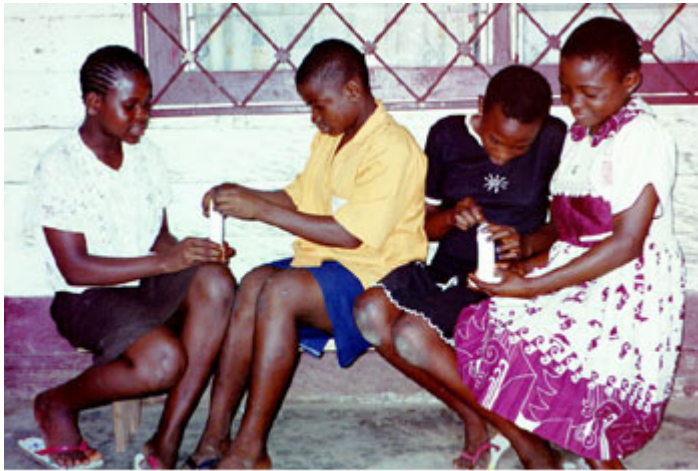
Condom practice in AIDS class

However, in Cameroon - unlike several other countries in Africa - we are encouraged to discuss the problem and engage in practical work. Much of our work has been to encourage this discussion amongst other young people and to distribute the information which we have here and from the UK - the "ABC Policy" - Abstinence, Be faithful, Condom use". Practising with condoms has been an interesting example of "opening up" the discussion. We are holding our final seminars for the youngsters of local schools (aged 15 - 20) and they are going well. The theme is AIDS awareness, but the seminars are very informal, and are basically a chance for everyone to share ideas. As we were setting up the project we became aware that the children are already very informed on the subject of AIDS and how to prevent it. Our research also showed that they already had formed their own opinions on how to deal with HIV and AIDS themselves, and within society. So we decided that re-informing them about the science of the virus was pointless. Instead we set up seminars. This gives the youngsters a chance to ask any questions, and express their own opinion, in an informal manner, with just small groups. We wanted to introduce the idea of tolerance, and the acceptance of AIDS, a concept that they are not yet too familiar with here. They went very well, and not only this but the children really enjoyed it.