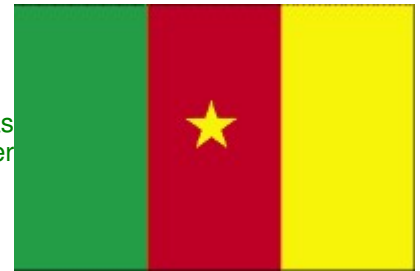
The Cameroon National Flag

Cameroon is not alone in Africa from suffering the devastating effects of AIDS.